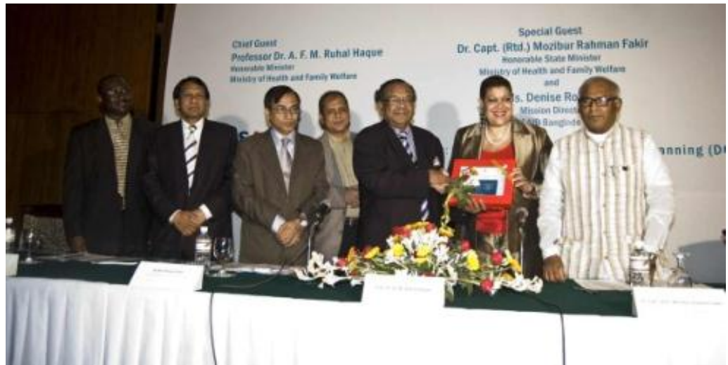
The launching ceremony of the online procurement tracking system