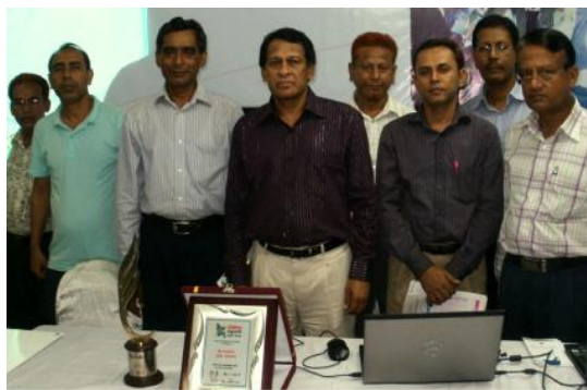
The DGFP team with their awards from the Digital Innovation Fair.

For the Bangladesh Government, officials are now able to track the status of procurement packages at every step of the way and ensure the packages' smooth progress. Also, procurement management is now efficient, effective, and transparent at the central level.