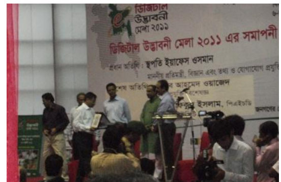
MOHFW Secretary receiving Best E-Governance Award.